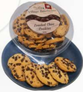
LOADED CHOC Unit Weight: 240G