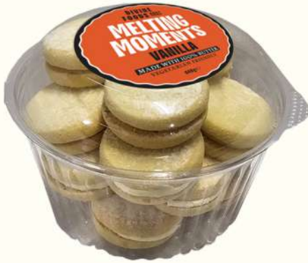
Vanilla - 640g