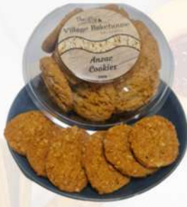
ANZAC Unit Weight: 240G