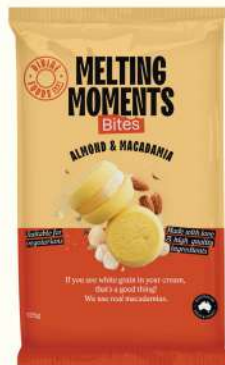
Almond and Macadamia