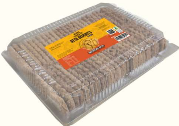
Atta Cookies - 700g