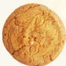
White Choc Macadamia DFGCWCM