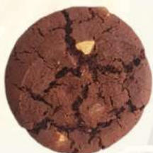
Triple Choc DFGCTCH