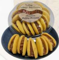
MELTING MOMENTS CHOCOLATE Unit Weight: 350G