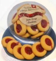
JAM DROPS Unit Weight: 240G