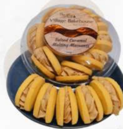
MELTING MOMENTS SALTED CARAMEL Unit Weight: 350G