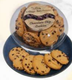
CHOC CHIP Unit Weight: 240G