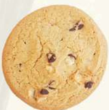
Dark Choc Macadamia DFGCDCM