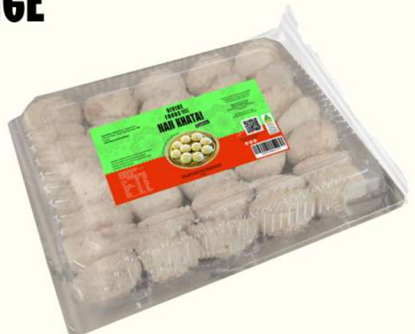
Nan Khatai - 700g