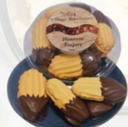
VIENNESE FINGERS Unit Weight: 300G