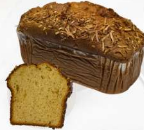
BANANA AND HONEY