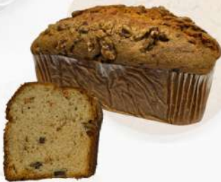
CARROT AND WALNUT