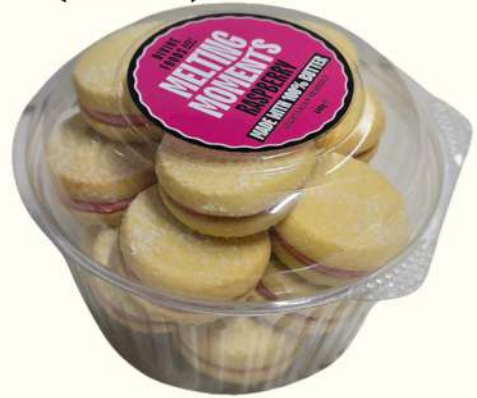
Raspberry - 640g