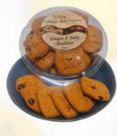
GINGER AND DATE Unit Weight: 240G