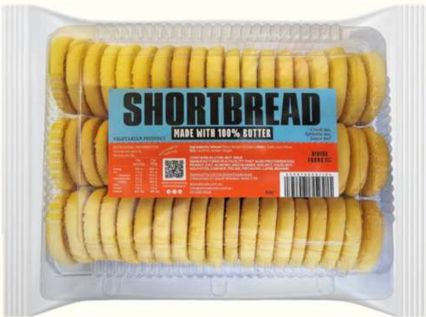
Butter Shortbread - 850g