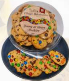
YOUNG AT HEART Unit Weight: 240G