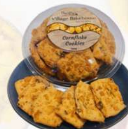
CORNFLAKES Unit Weight: 240G