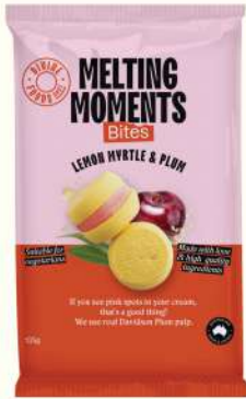
Lemon Myrtle and Plum