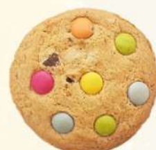
Rainbow Choc Chip DFGCRCC