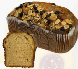
DATE AND HONEY