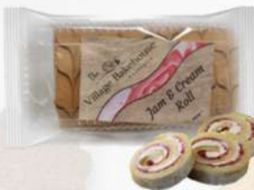
JAM AND CREAM