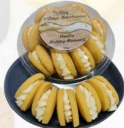
MELTING MOMENTS VANILLA Unit Weight: 350G