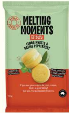
Lemon Myrtle and Native Peppermint