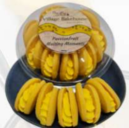
MELTING MOMENTS PASSIONFRUIT Unit Weight: 350G