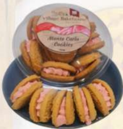
MONTE CARLO Unit Weight: 320G