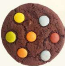
Double Choc Rainbow Choc Chip DFGCDCR