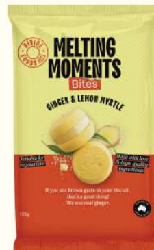
Ginger and Lemon Myrtle