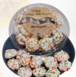
MERINGUES Unit Weight: 80G