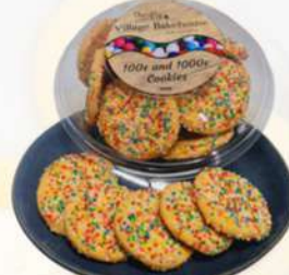
100'S AND 1000'S Unit Weight: 240G