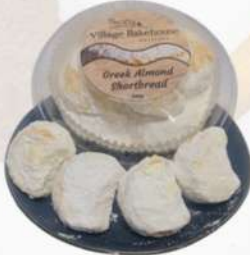
GREEK ALMOND SHORTBREAD Unit Weight: 240G